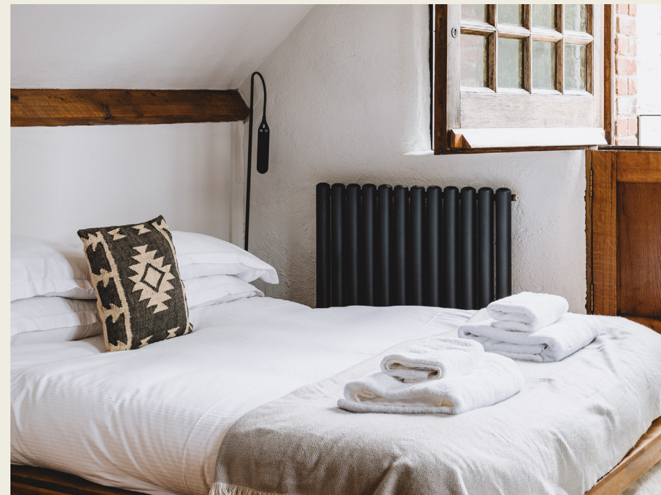
The Library Barn