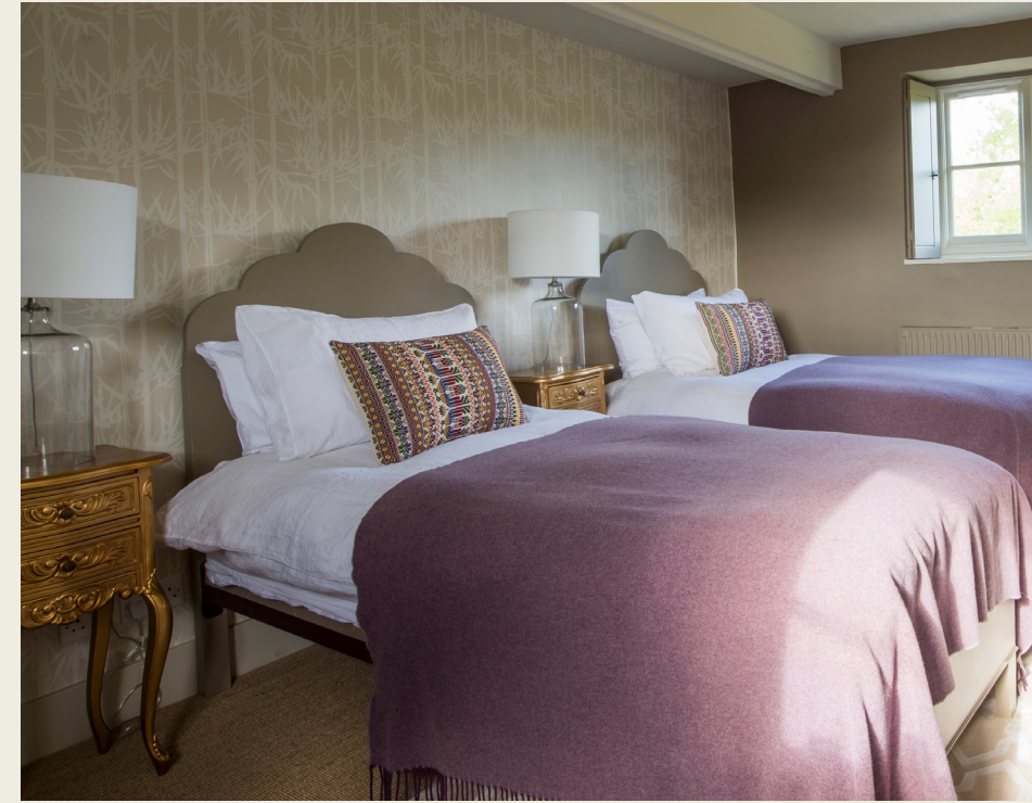
The Deer Cottage