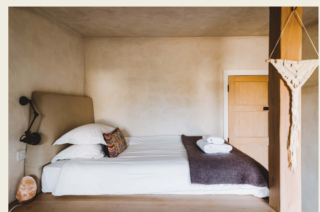
The Swallows Nest